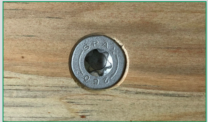
SPAX DELTA ® -SEAL after 12 months in ACQ treated timber.