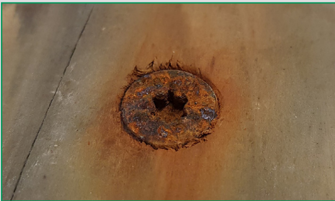
Galvanised screw after 12 months in ACQ treated timber.