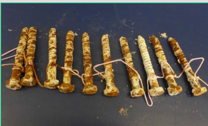
Hot-dipped galvanised screws. Showing significant base material corrosion.